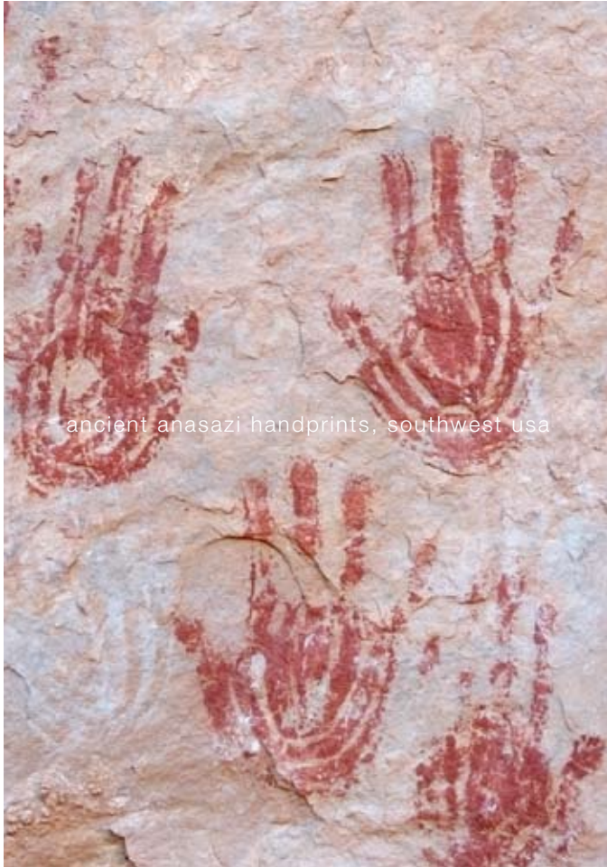
ancient anasazi handprints, southwest usa