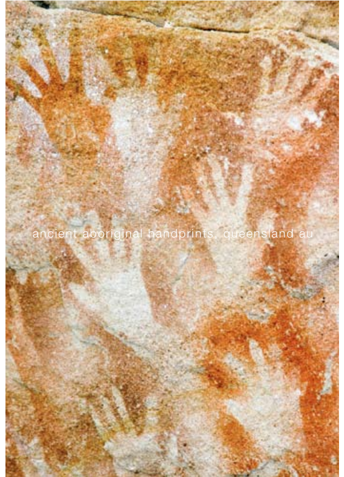
ancient aboriginal handprints, queensland au